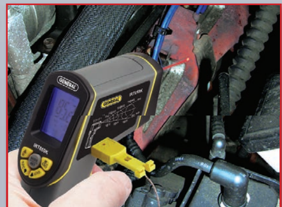
Looking for hot spots under the hood