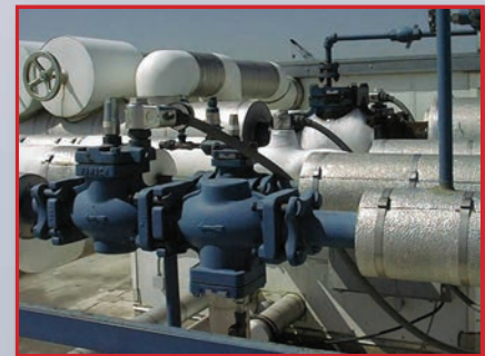
Maintaining ammonia refrigeration piping